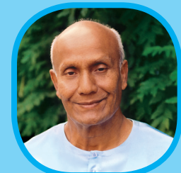
Sri Chinmoy founder

The Oneness-Heart -Tears and Smiles Worldwide Humanitarian Service